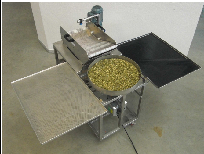
Tray deposit on the sides as optional accessory