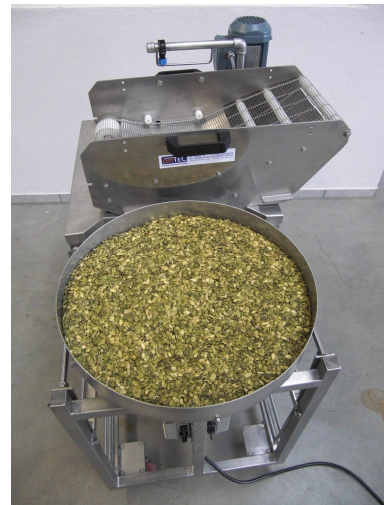
conveyor can be taken out

BMTEC GmbH Am Kornfeld 3a D-83562 Rechtmehring Fon +49 +8076 8888-0 Fax +49 +8076 8888-10 info@bmtec.de www.bmtec.de